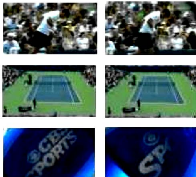
(a) Previous shot

frame with obvious LOGO mark directly from video frame sequence; (ii) semi-automatic extraction method, such as choose by hand several frames which contain obvious LOGO sign [15]; then utilize frame average method to calculate their mean value and use as LOGO template; (iii) automatic extraction method: from 3-5 candidate LOGO shots, choose one candidate LOGO frame, then cluster those candidate frames; calculate the mean value of candidate LOGO frames around the clustering center and use as LOGO template [16]. In the paper, the extraction of LOGO template is realized by semi-automatic method.