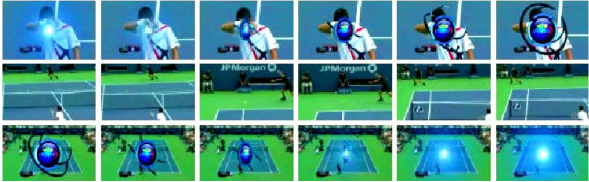
Fig 3 After an accurate positioning of the slow shot boundary effect chart