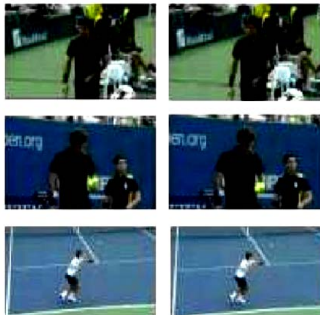
(b) Rear shot